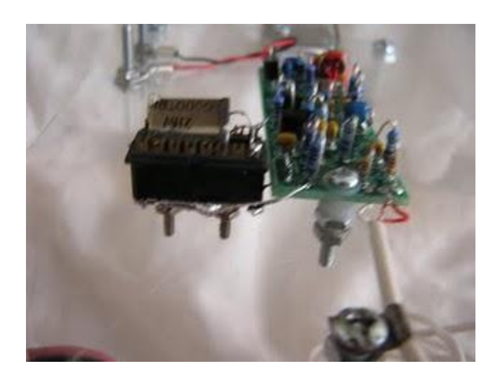
Side view of Xtal Socket

I mounted the PCB on a piece of Plexiglas because I keep breaking the leads and it is hard to solder them back without damaging something. I broke the leads on my crystal (it was a plastic IC) during testing. Just too much handling. My solution to the crystal mechanical support was to add a 16 Pin IC socket to hold the IC on a 16 Pin Header plug. This way I can change frequency without damage. If you are not planning on changing frequency epoxy would work.