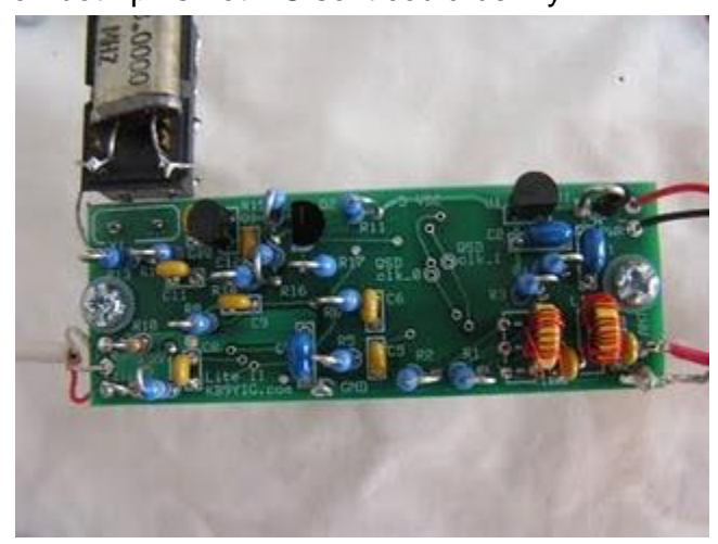
Soft Rock 20M Lite II (top)

I had the best results by put the string solder over the top of the IC lead (pointing out just like the IC lead) and place the iron tip at the end of the IC lead (pointing directly into the IC lead). Touch the string solder to the iron tip just as the tip contacts the lead, meter the "right" amount of solder (very little) as you pull the iron away from the IC. The solder will flow up without bridging, when you pull the iron away the excess solder will stay with the iron. The voltage and current in the test steps agreed with the instructions in every case except the mixer test. On U3 I had 2.66 V on pins 2 &14 instead of the 2.5 V listed. This is 4.6 MHz on both pins not DC so it could be my DVM.